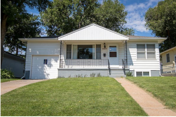
House 4 – 2211 10 th Avenue