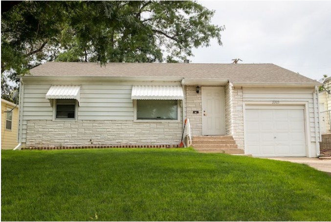
House 2 – 2205 10 th Avenue