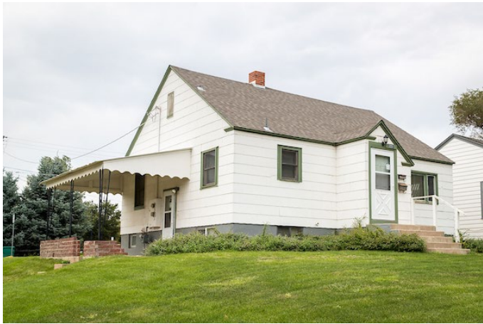
House 8 – 2237 10 th Avenue