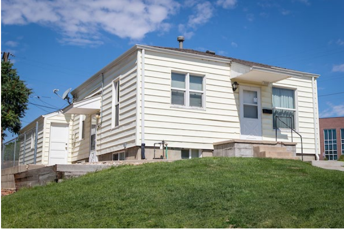
House 1 – 2203 10 th Avenue