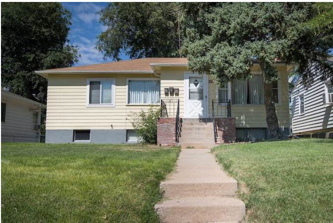
House 3 – 2209 10 th Avenue