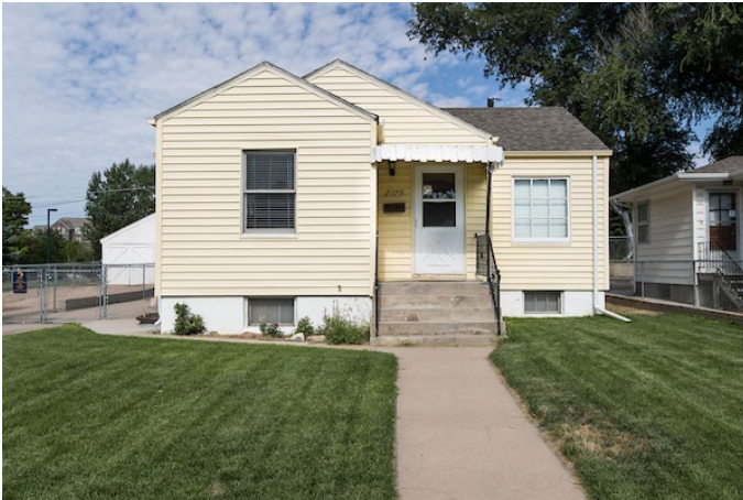
House 6 – 2229 10 th Avenue