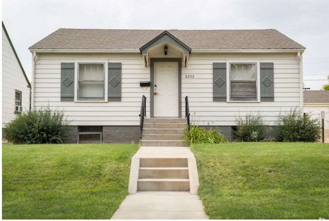
House 7 – 2233 10 th Avenue