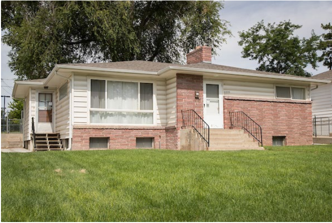
House 5 – 2225 10 th Avenue