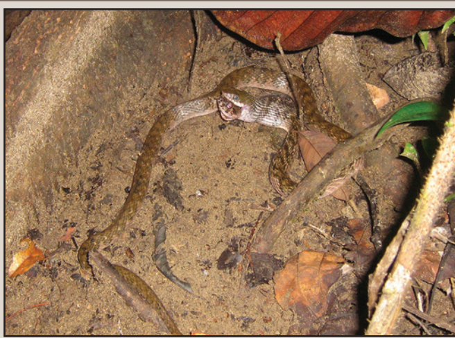
FIG. 1. Xenochrophis trianguligerus consuming a fanged frog ( Limnonectes sp.) in Lambusango Forest Reserve, Buton Island, southeast Sulawesi, Indonesia.

Holland Publishers, London, UK. 376 pp.). However, the diet of X. trianguligerus east of Wallace's Line, in Sulawesi and the Moluccas, remains poorly documented (de Lang and Vogel 2005. The Snakes of Sulawesi . Edition Chimaira Publishing, Frankfurt, Germany. 312 pp.). Here, we report observations of this species pre-dating and consuming fanged frogs ( Limnonectes sp.) in Sulawesi.