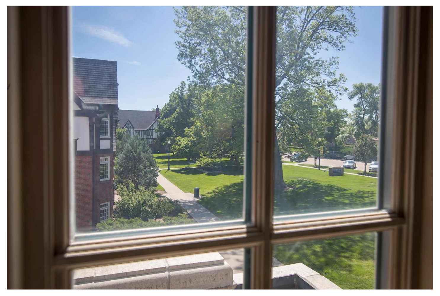
ABOUT HOUSING & RESIDENTIAL EDUCATION