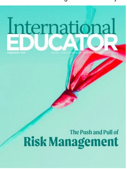
February 2021: Risk Management