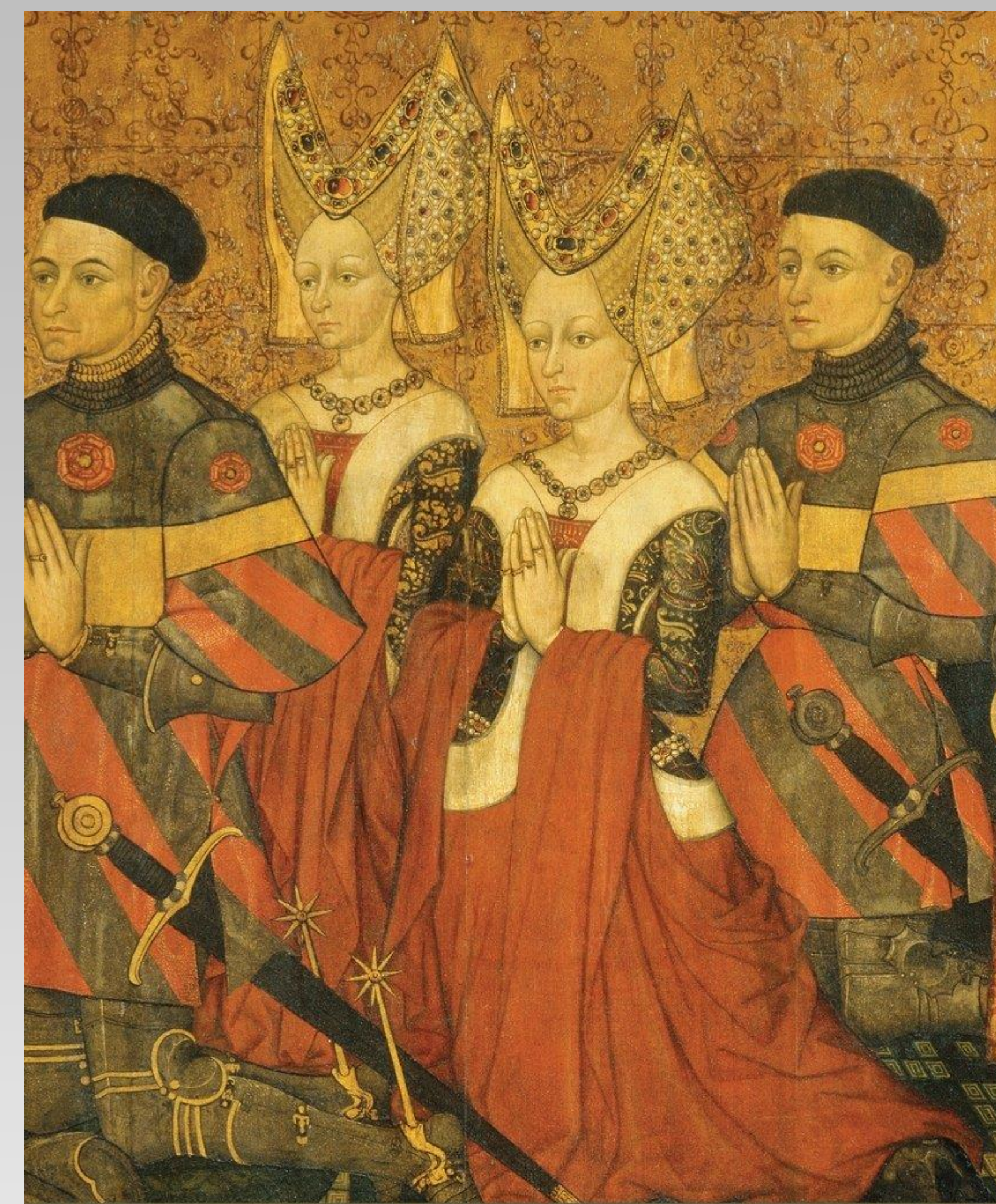
BROTHERS AND SISTERS IN MEDIEVAL EUROPEAN LITERATURE CAROLYNE LARRINGTON

Out of all the relationships found in medieval literature, brotherly relationships evoke some of the strongest senses of loyalty and unity. According to Carolyn Larrington in Brothers and Sisters In Medieval European Literature , “the fraternal relationship is the most profoundly experienced bond in medieval literature” (73).